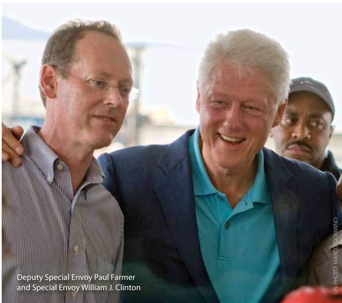
Deputy Special Envoy Paul Farmer and Special Envoy William J. Clinton