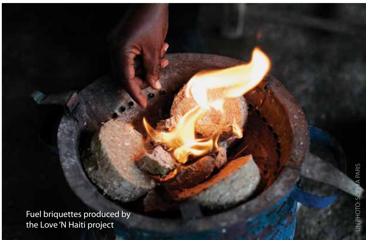
Fuel briquettes produced by the Love 'N Haiti project